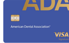
ADA ® Preferred Rewards Visa Signature ® Card