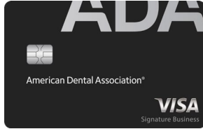
ADA ® Business Rewards Visa Signature ® Card

Earn points when you use your ADA ® Visa ® Card for dues payments and purchases that will help advance your career and your practice.